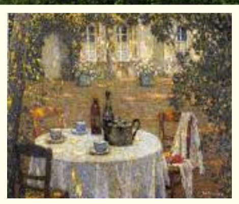
LEFT: The red rose of Picardy can be seen around the village CLOCKWISE FROM TOP LEFT: The gardens of Henri Le Sidaner; Étienne Le Sidaner; Work continues; La Table au Soleil by Le Sidaner